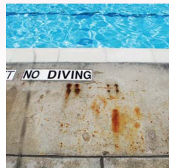
Rust Near Pool