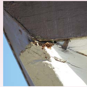
Dry Rot at Pool House