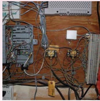
Outdated Phone Lines