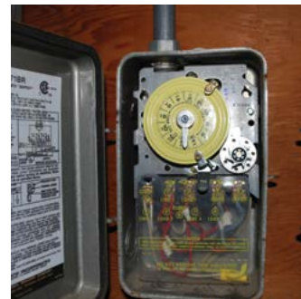
Antiquated Heating Timers