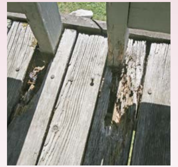
Decaying Balcony Floor