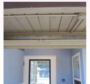
Exposed Gas Lines