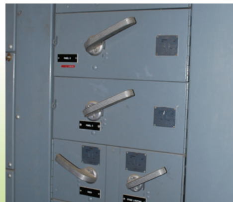
Electrical is Out of Date