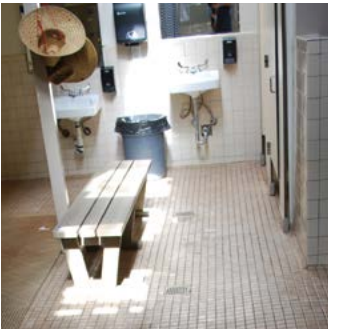
Outdated Changing/ Bathing Rooms