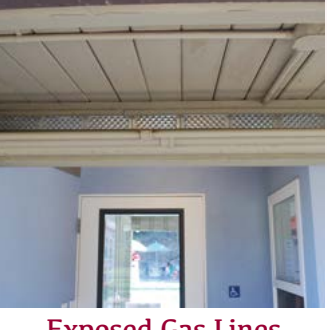
Exposed Gas Lines