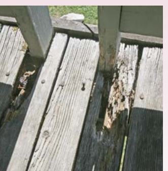
Decaying Balcony Floor