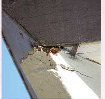
Dry Rot at Pool House