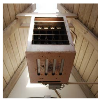
Decades-Old Air Heaters