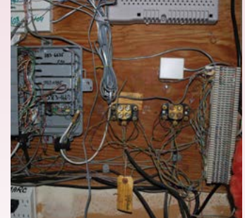
Outdated Phone Lines