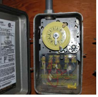
Antiquated Heating Timers